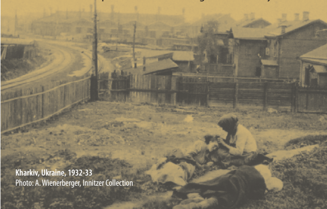
Kharkiv, Ukraine, 1932-33

Educators are encouraged to take time in April to remember those who suffered and lost their lives in the Holodomor and other genocides, to commit to using education to protect and defend human rights and dignity everywhere, and to stand up against prejudice, hate and other forms of exclusionary practices that are known precursors to crimes against humanity.