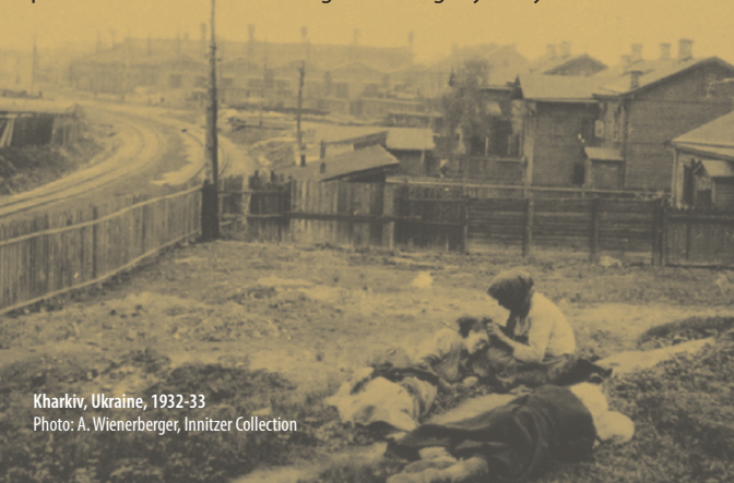
Kharkiv, Ukraine, 1932-33

Educators are encouraged to take time in April to remember those who suffered and lost their lives in the Holodomor and other genocides, and to commit to using education to protect and defend human rights and dignity everywhere.