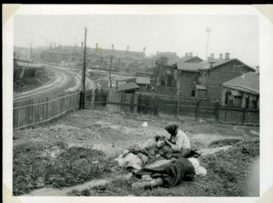
Kharkiv, Ukraine, 1932-33